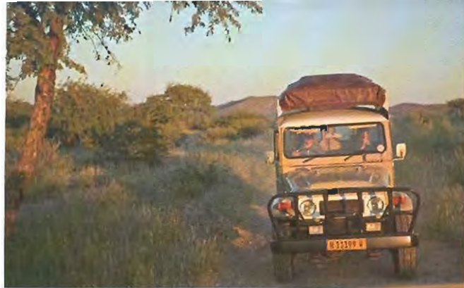
CLOCKWISE FROM TOP: See wild animals from the comfort of a Land Rover on safari in South Africa; At Turtle Island in Fiji, there are swarms of fish but only a few other guests; Bath or plunge pool? Face this dilemma daily at The Ritz-Carlton Bali.