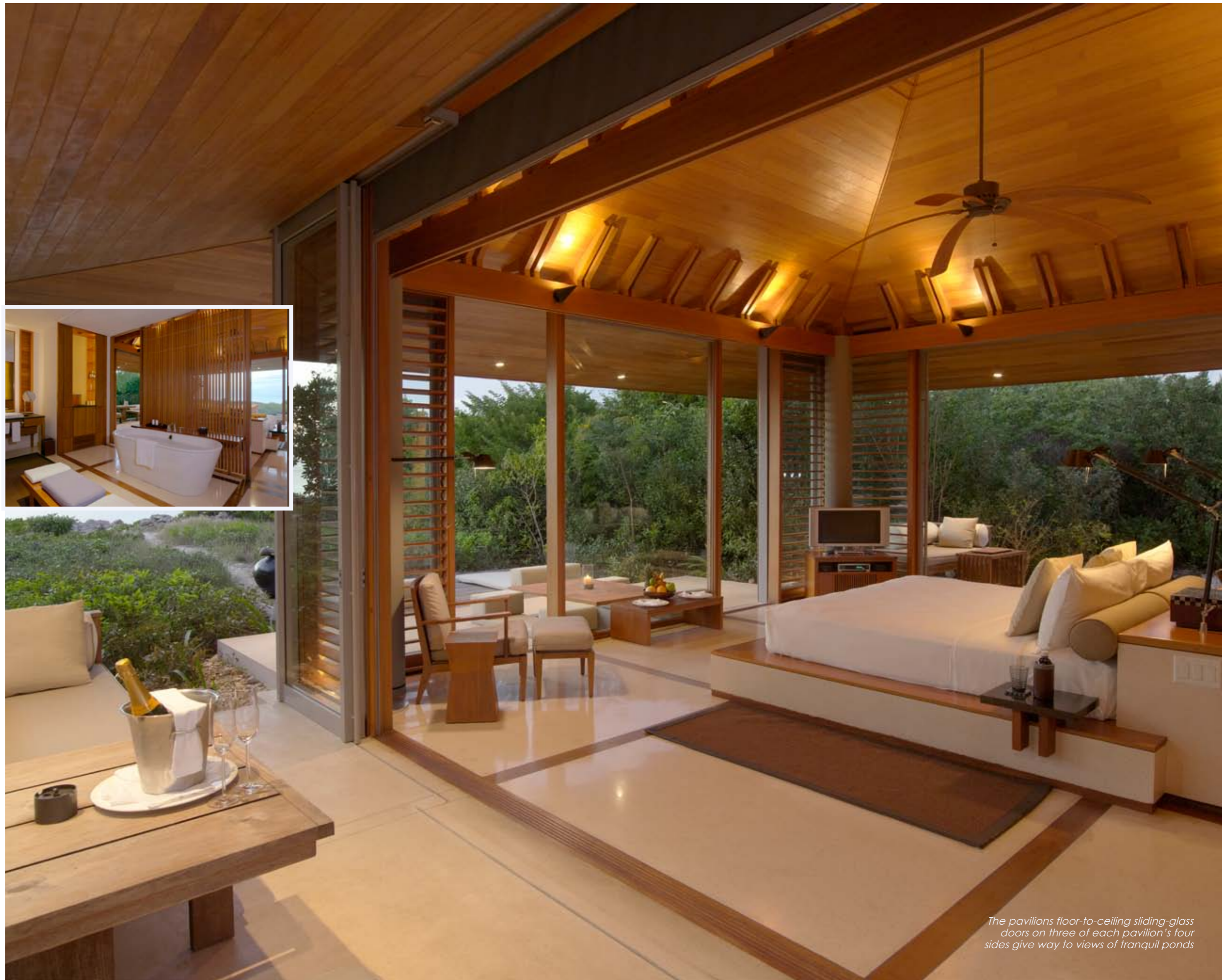
The pavilions floor-to-ceiling sliding-glass doors on three of each pavilion's four sides give way to views of tranquil ponds

Caribbean resort design was in danger of becoming rather predictable, that is until Amanyara and a few choice others came along. ■