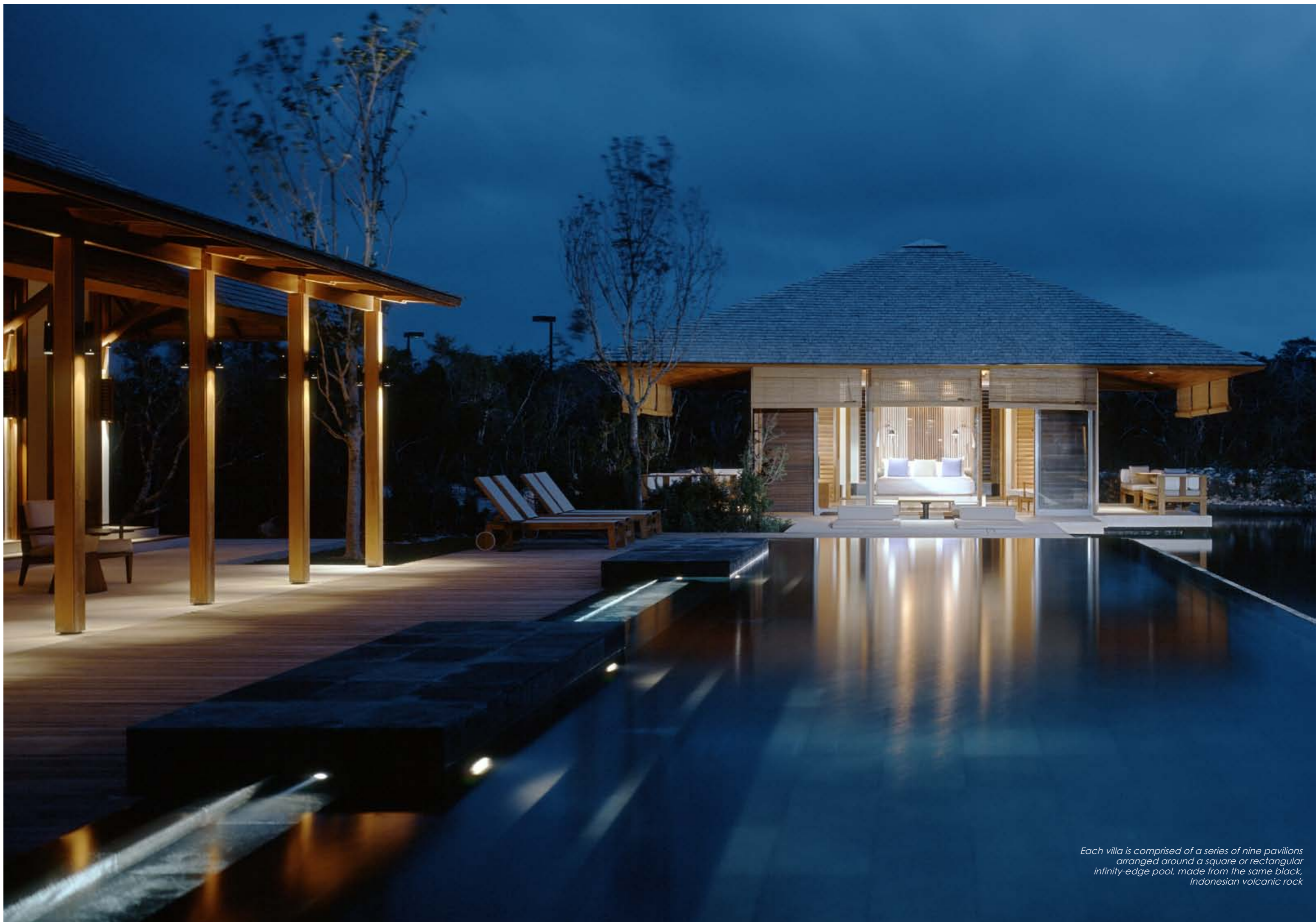
Each villa is comprised of a series of nine pavilions arranged around a square or rectangular infinity-edge pool, made from the same black, Indonesian volcanic rock